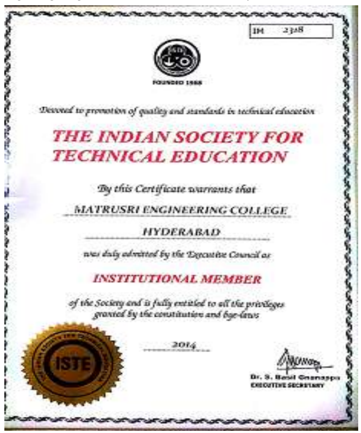
Fig ISTE Institutional Membership Certificate

Matrusri Engineering College was certified as Institutional Member by ISTE in 2016.